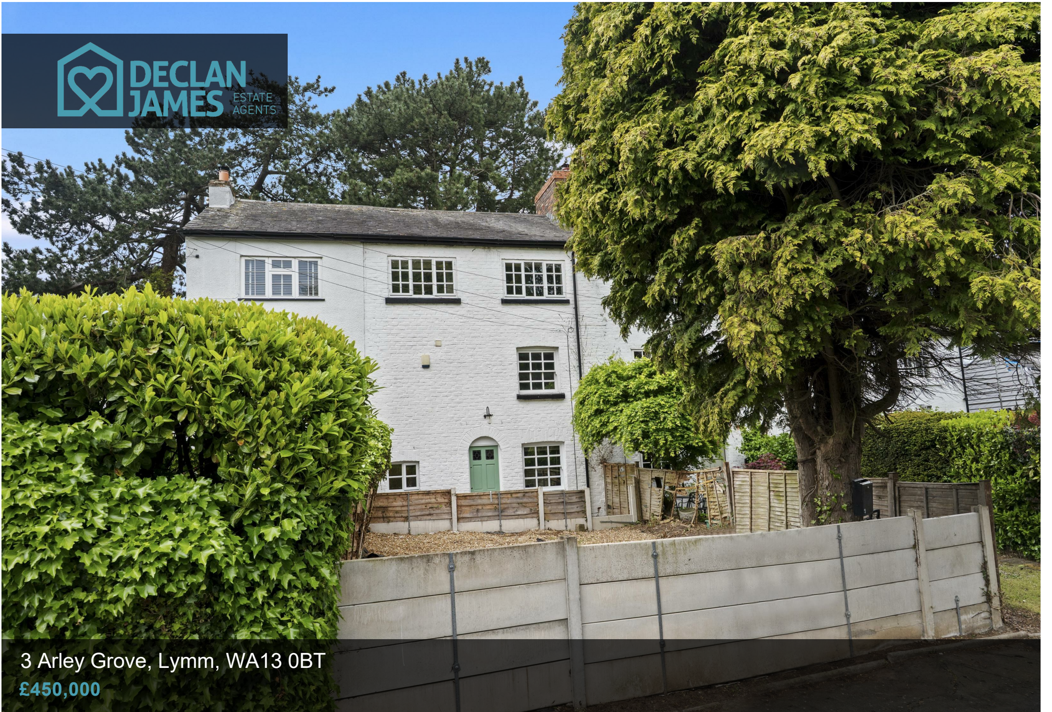
3 Arley Grove, Lymm, WA13 0BT £450,000